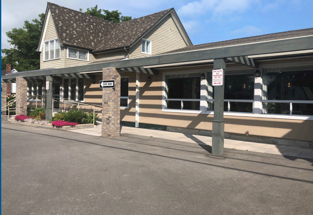
Manor on Loyalist Parkway - Picton